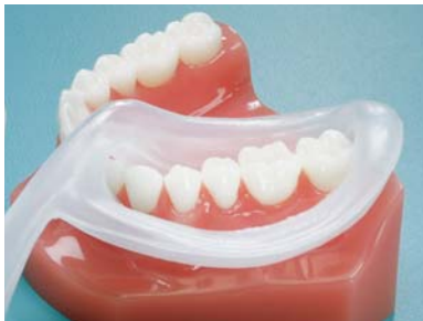
12910 Fast Dam. Specify right or left side.