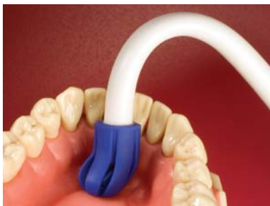
11610 Total Comfort™ with clear tips