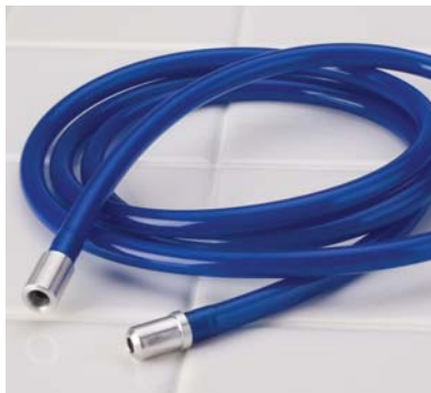
FeatherFlex is lightweight, ergonomic and efficient.